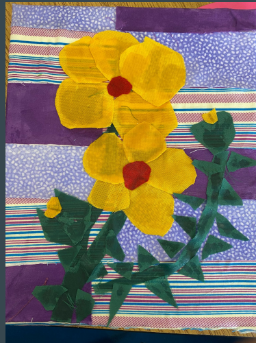
2nd Grade Puccoon - Fiber Arts